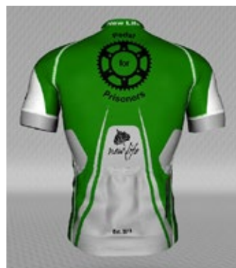
New Life riders wear this bike jersey for RAGBRAI (back view).

We hope you will encourage the riders by giving a donation. The reason we ride is to help New Life Prison Church thrive. Pedal for Prisoners is our number-one fundraiser. Will you sponsor us?