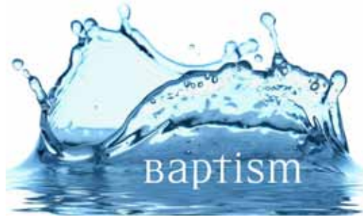
Baptism was the highlight of the service.

An attitude of gratitude. That was the theme of my Thanksgiving message on November 21 at the prison gym. After reading from Numbers 11, I called on the New Life prison congregation to learn from ancient Israel. Don't complain but go against the grain! Through the Holy Spirit, our hearts are becoming more grateful to God.